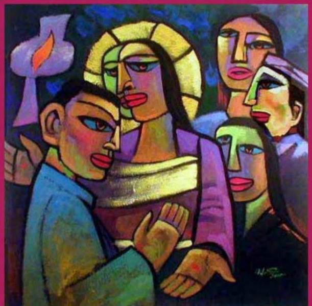
"Doubting" Thomas and Jesus